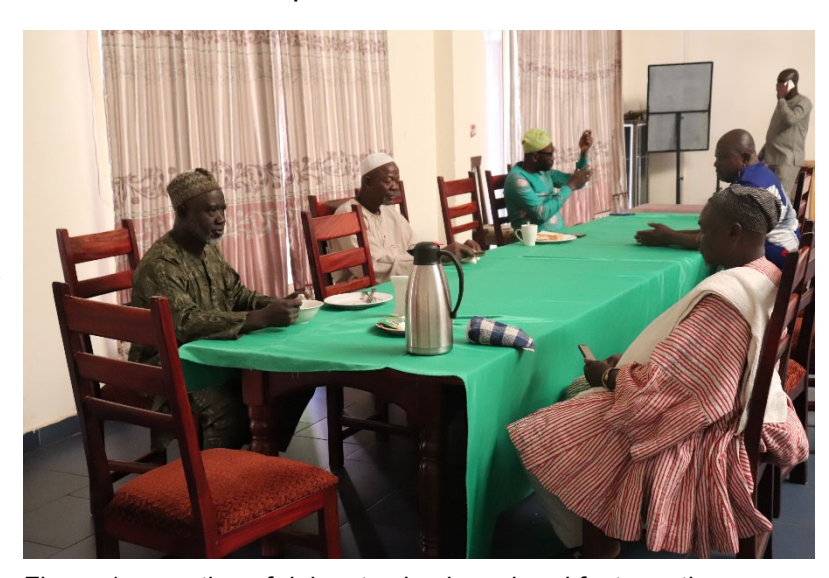
Figure 1: a section of delegates having a breakfast meeting

The delegation visited thirteen (13) very important palaces in Tamale, Kumbungu, Savelugu, Tolon, Yendi, Dakpe and Sagnarigu. The delegation is grateful to the GIZ E-waste programme for the keen interest in the Peace process and also for providing the financial and logistical resources for the historic trip to Kingdom. Dagbon following report details the visit to the main Palaces palace and the outcomes