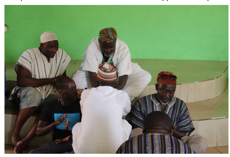
delegation, expressed Fig 16: Welcome kola from the representative of Gukpe

concern over a perception among some Dagbon youth that, persons who belong to opposing political parties are enemies. Dingon now used the Jinapor family at Buipe as an example of 3 brothers who belong to different political parties, but live together in the same household. He advised the youth of Dagbon to take a cue from the three brothers and unite for the common good of the Kingdom.