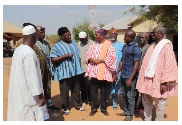
Fig. 20: Tit-a-tit between chiefs at Kumbungu

The Kpihigu Na, commended the GIZ and the Peace Committee for the efforts, saying, with the return of peace to Dagbon, chiefs in Dagbon are concerned about how to reconstruct the image of Dagbon. He noted that, the frequent conlicts at Old Fadama are a disgrace and pledged his support to the committee. The Kpihigu Na also assured the delegation that, the message will be delivered to the Kumbungu Na on his return.